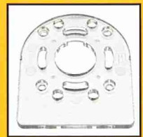
DNP614 Shaped Sub Base