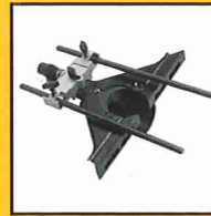
DW6913 Edge Guide for Plunge Base