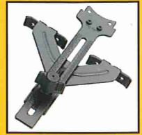
DNP618 Edge Guide for Fixed Base