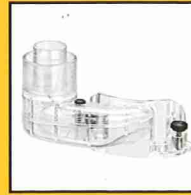
DNP615 Dust Collection Adapter for Fixed Base