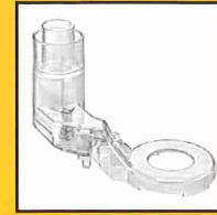
DNP616 Dust Collection Adapter for Plunge Base