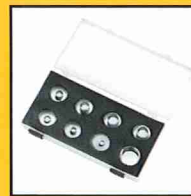
DW6188 Template Guide Set