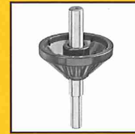
DNP617 Centering Cone